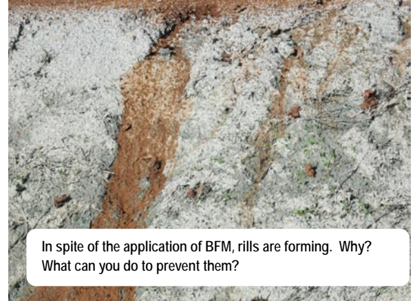
In spite of the application of BFM, rills are forming. Why? What can you do to prevent them?

This month on Sunday, December 2, many parts of Northern California were walloped by a storm producing in 24 hours over 5 inches of rain; which is close to the 100-year 24-hour rainfall amount. This storm caused a significant amount of runoff to flow across already saturated soils testing even some of the best erosion control BMPs. Post-storm inspections at many projects revealed a common problem ... rills! According to the CESSWI Inspector Manual 1 , “rill erosion develops as the shallow surface flow begins to concentrate in low spots. The concentrated flow increases in velocity and turbulence, which in turn causes the detachment and transport of more soil particles. This action cuts tiny well-defined channels called rills, which are usually only a few inches deep.” In your QSP/QSD training class, you may have learned that the precursors to rill erosion are splash (raindrop) erosion and sheet erosion. Rills produce 100 times more detached particles than sheet erosion. However, if corrective action is not taken, rills may quickly combine to form a gully which produces 100 times erosion than rills. Therefore, when rills start occurring it is vital to address them. The important thing to remember about rills is that they are not the problem but a symptom of a weakness or failure in your erosion protection plan. The following are suggestions for preventing and repairing rills.